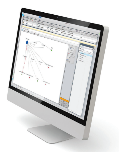
EDR has helped organisations and law firms navigate the complex process of eDiscovery through state-ofthe-art technology.

We have produced over one billion documents and nearly 13 billion pages out of EDR in the past 10 years.